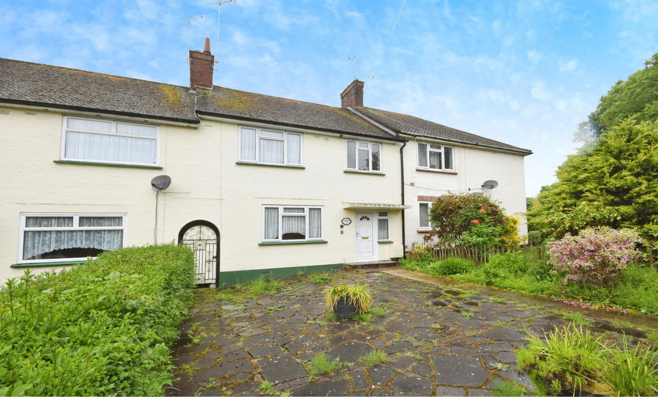
Lime Avenue, Brentwood, CM13 2DU