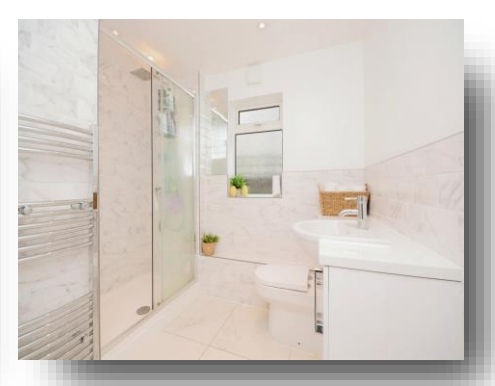
A 1023 Telegrage Rd West Way