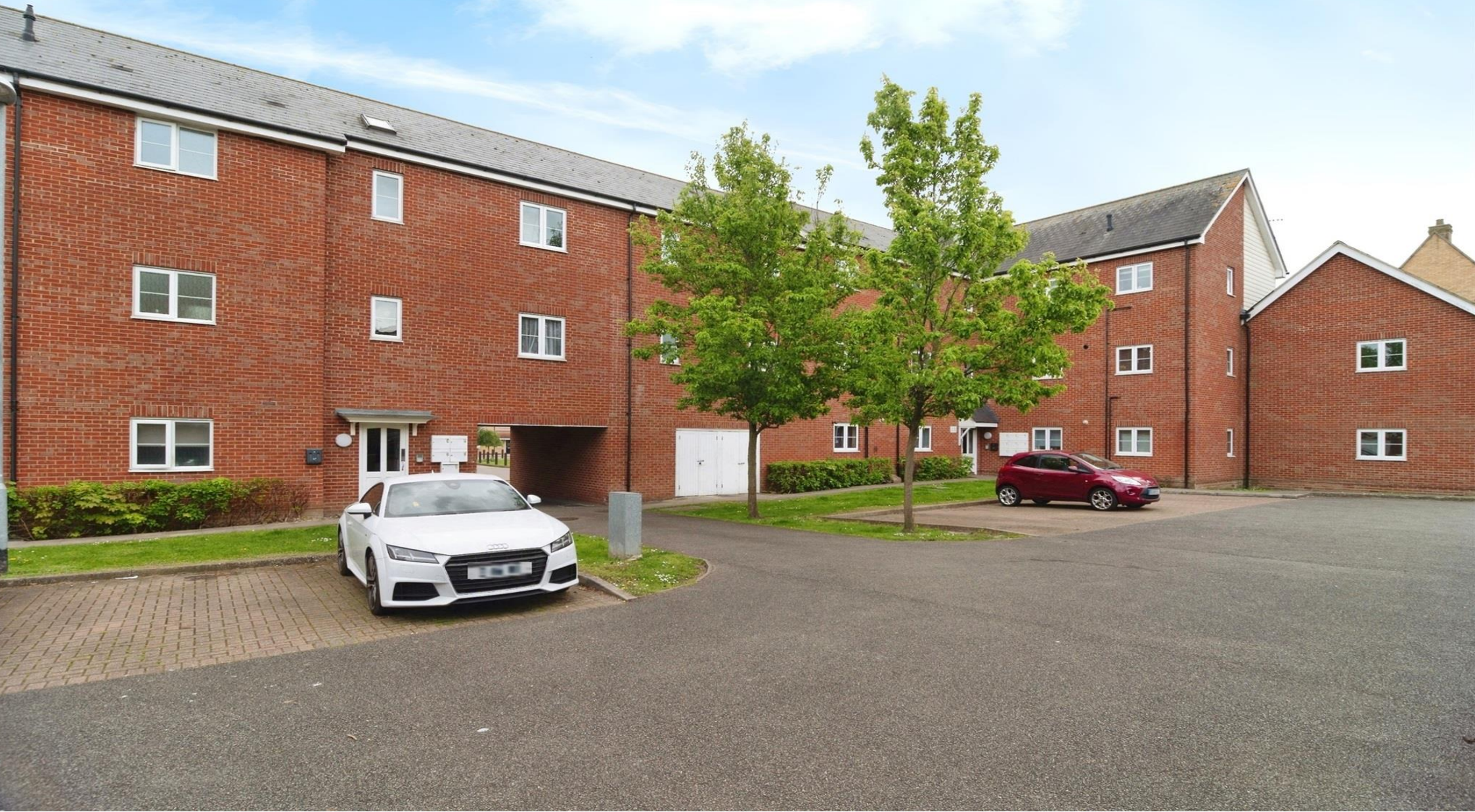
Harrow House, School Avenue, Basildon, SS15 6GN