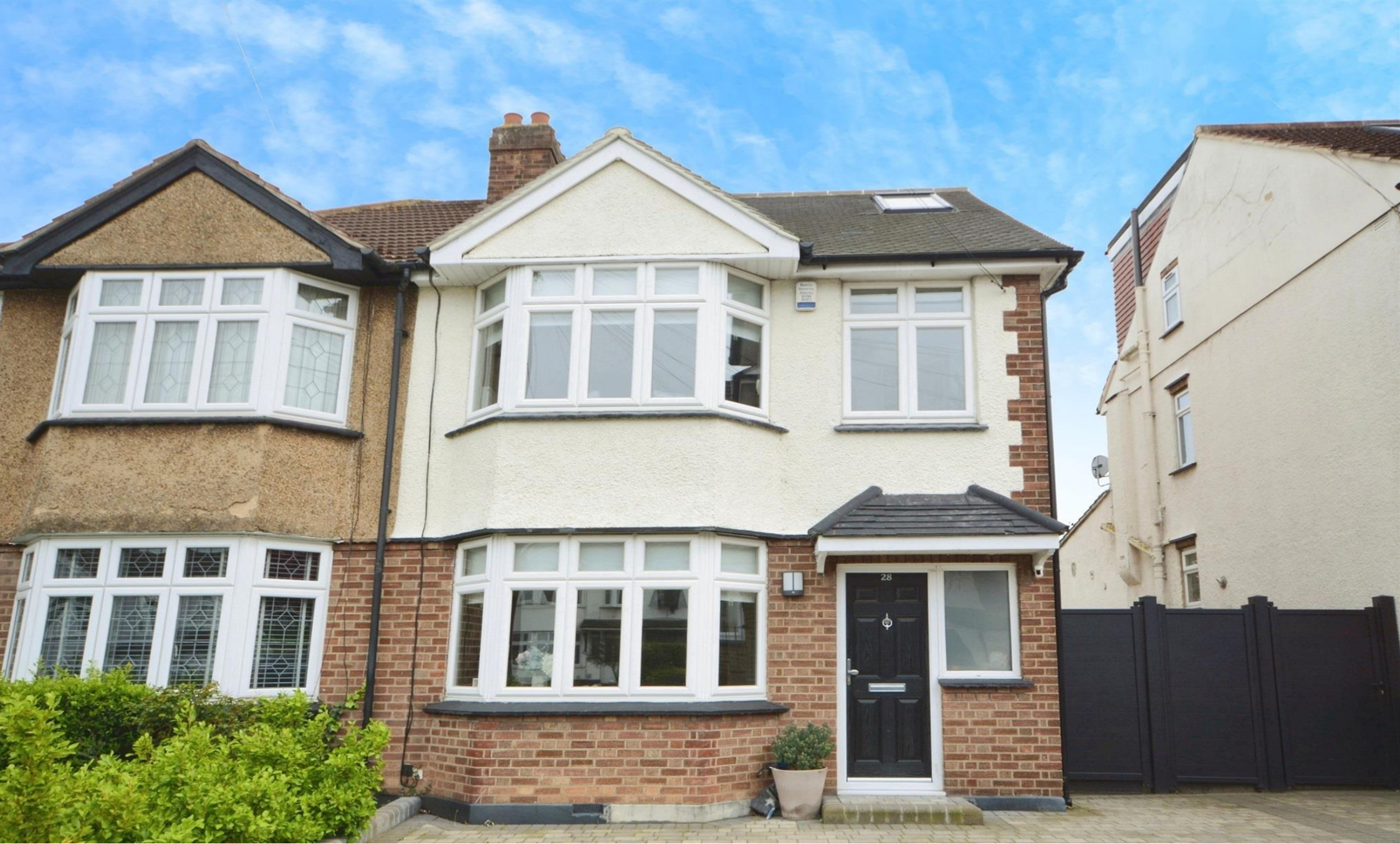
Mascalls Lane, Brentwood, CM14 5LR