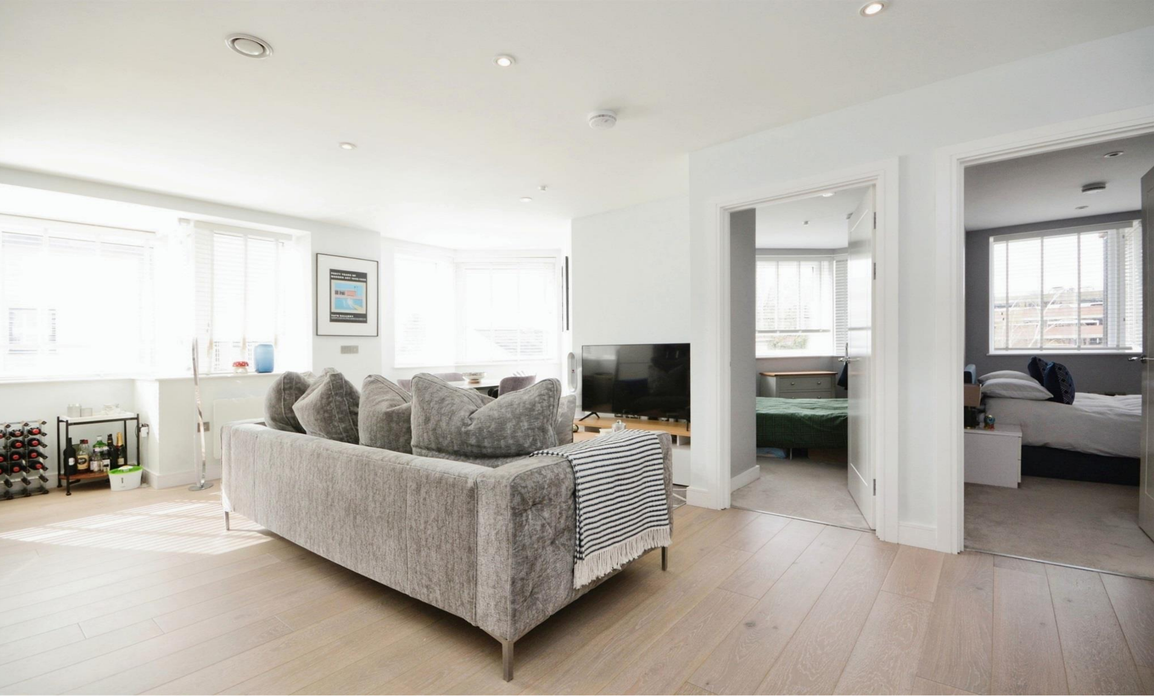
Library House, New Road, Brentwood, CM14 4GD