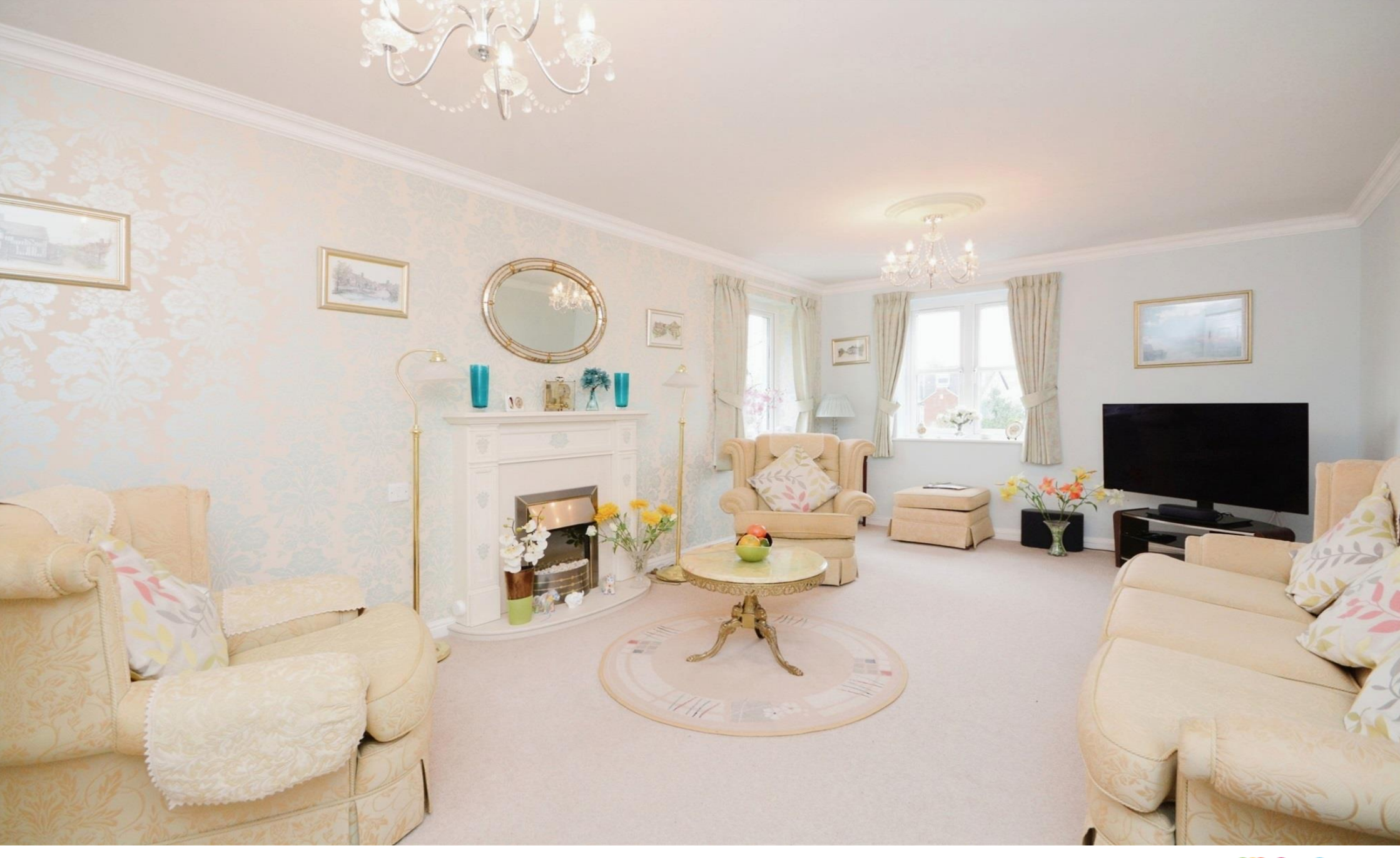
Sanders Court, Junction Road, Warley, Brentwood, CM14 5FG