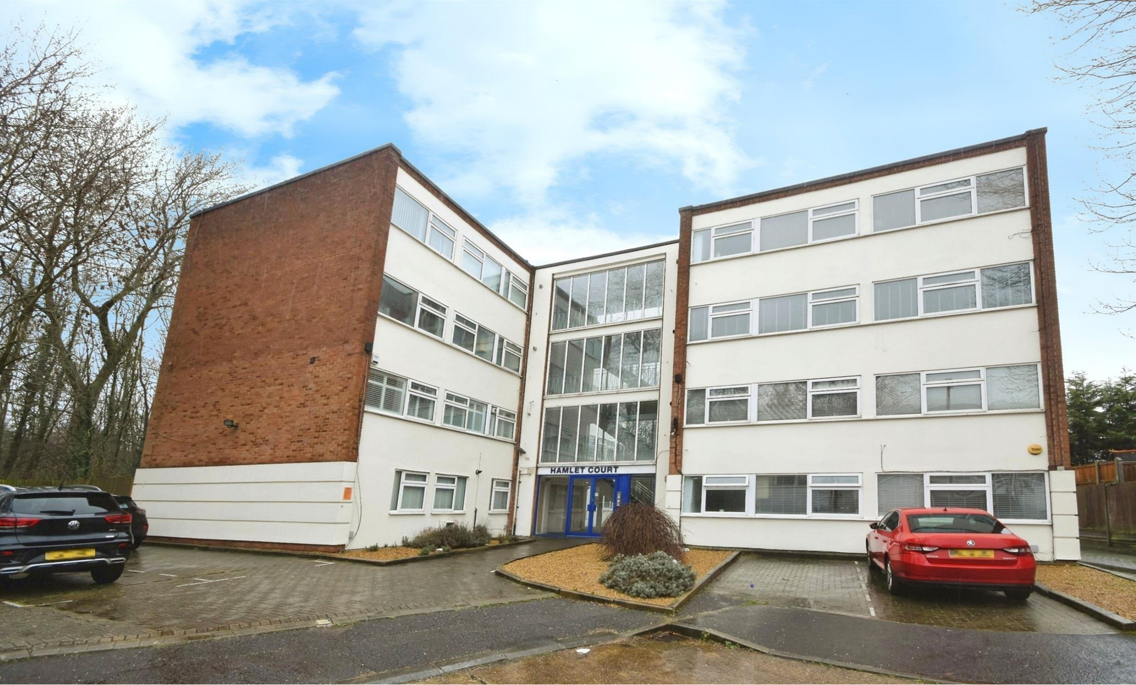
Hamlet Court, Leonard Way, Brentwood, CM14 5PE