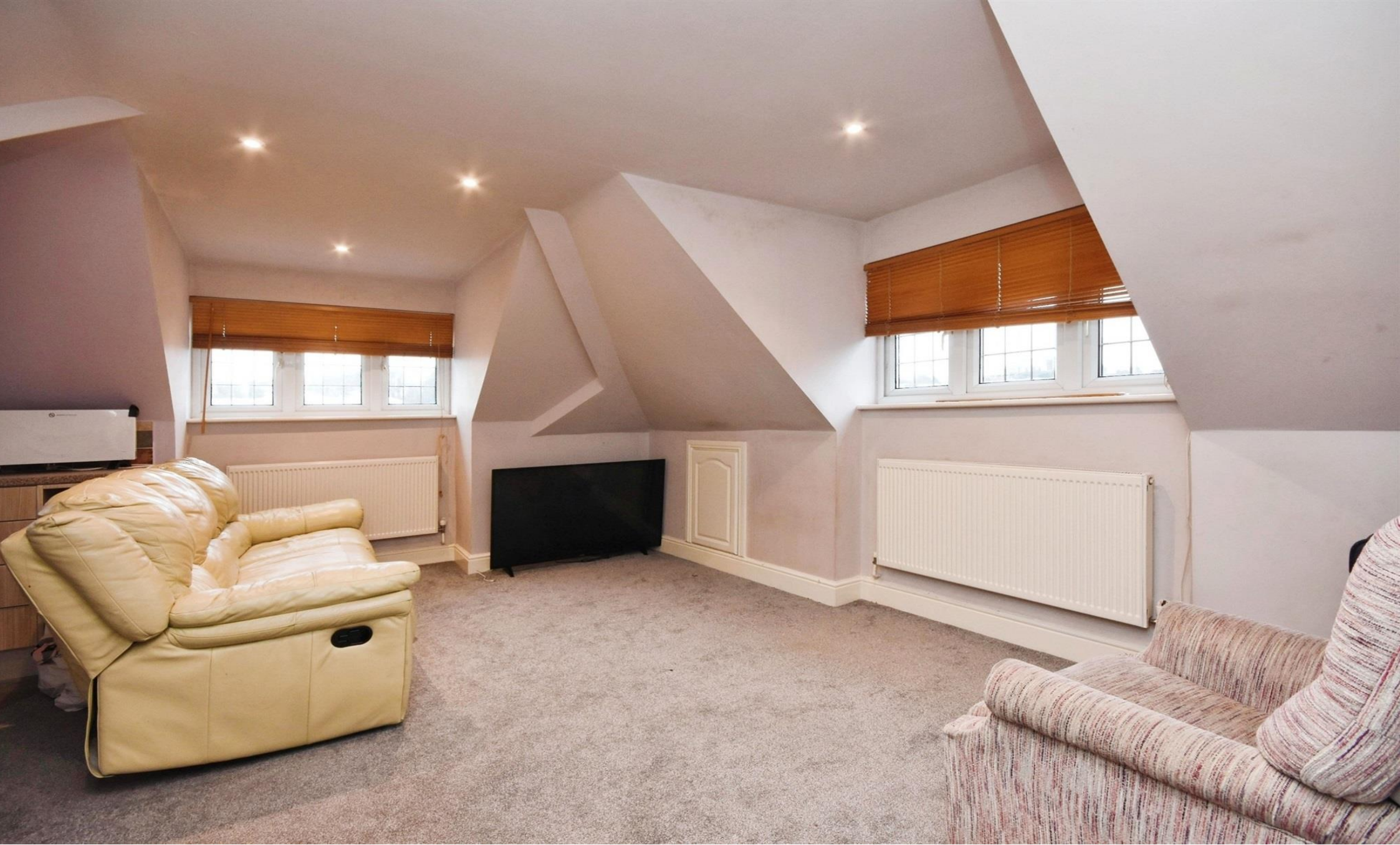
Haywards Court, Milton Road, Warley, Brentwood, CM14 5AD