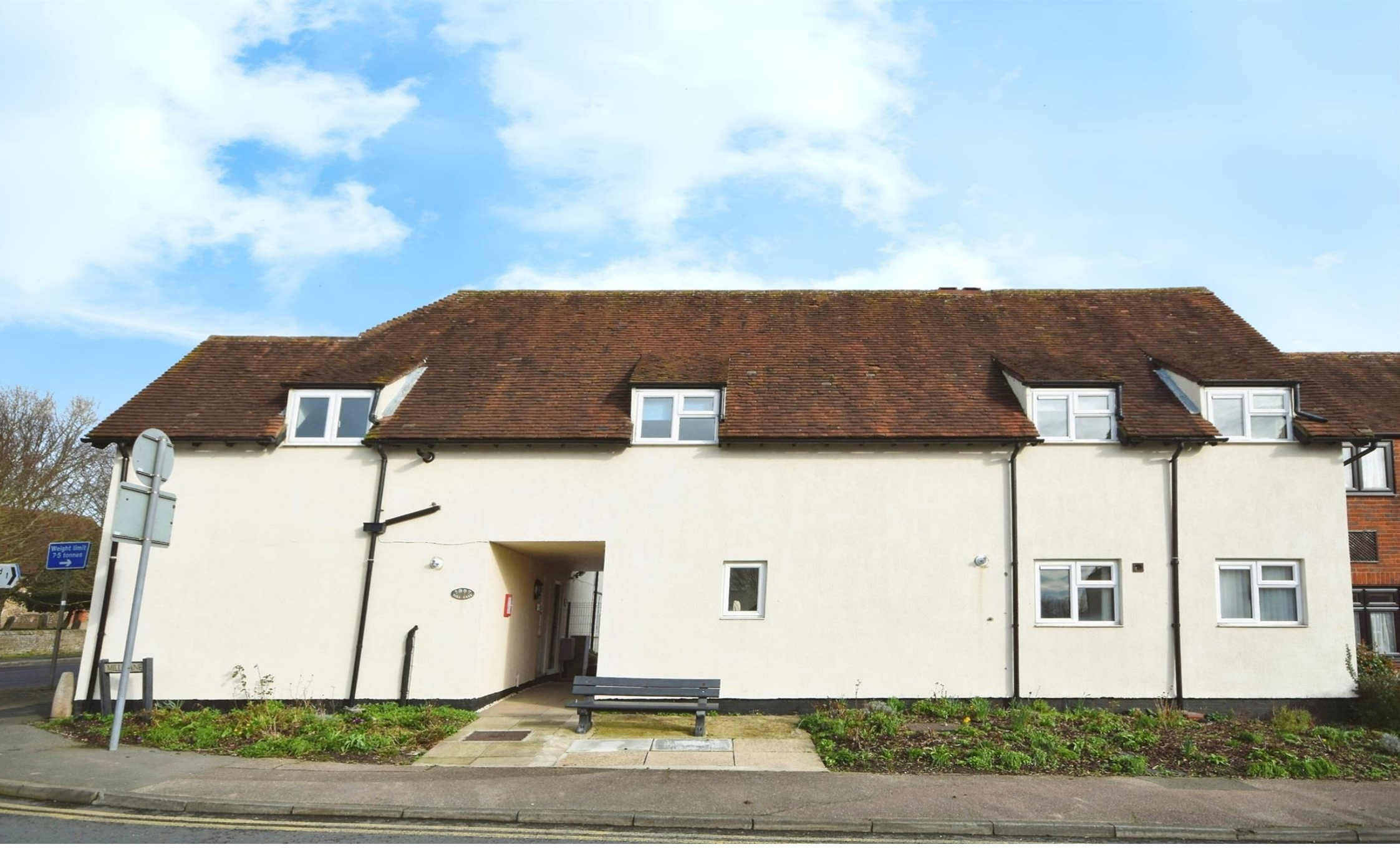
Mill Lane, High Ongar, Ongar, CM5 9RN