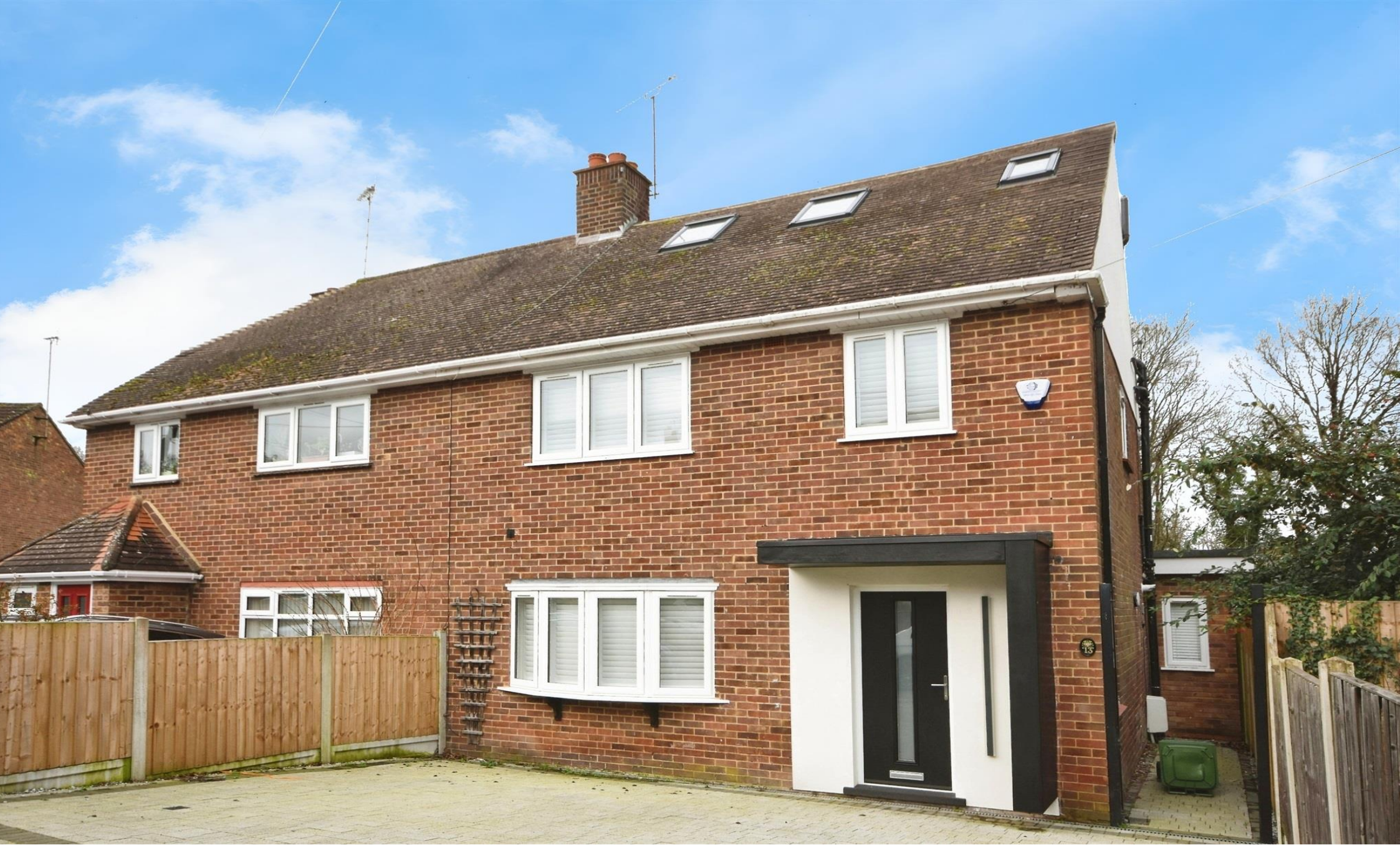
Firsgrove Crescent, Warley, Brentwood, CM14 5JL