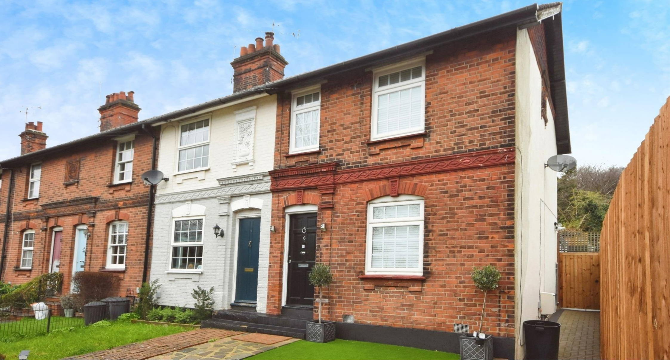
Kavanaghs Terrace, Brentwood, CM14 4NF