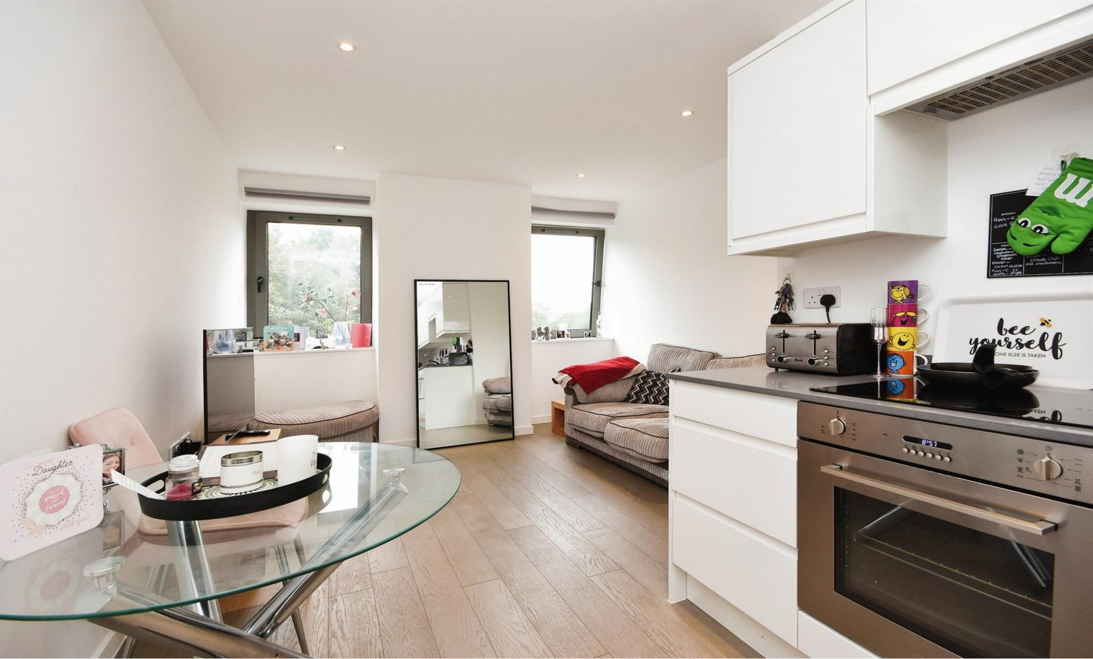
Regent House, Hubert Road, Brentwood, CM14 4WN