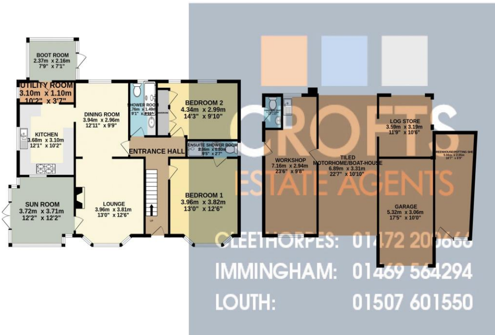
TOTAL FLOOR AREA : 207.0 sq.m. (2228 sq.ft.) approx.

Whilst every attempt has been made to ensure the accuracy of the floorplan contained here, measurements of doors, windows, rooms and any other items are approximate and no responsibility is taken for any error, omission or mis-statement. This plan is for illustrative purposes only and should be used as such by any prospective purchaser. The services, systems and appliances shown have not been tested and no guarantee as to their operability or efficiency can be given. Made with Metropix ©2024