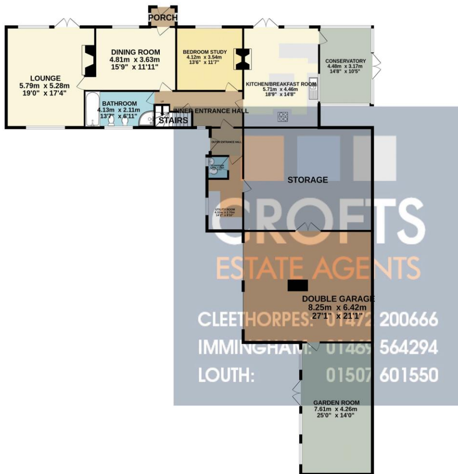
GROUND FLOOR 260.2 sq.m. (2801 sq.ft.) approx.