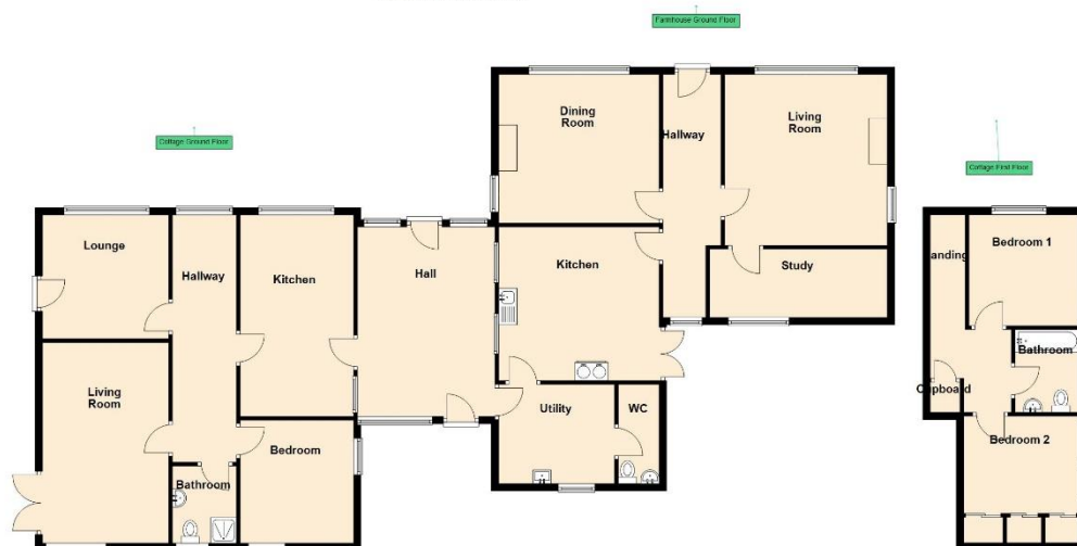
Ground Floor Approx. 186.7 sq. metres (2029.2 sq. feet)