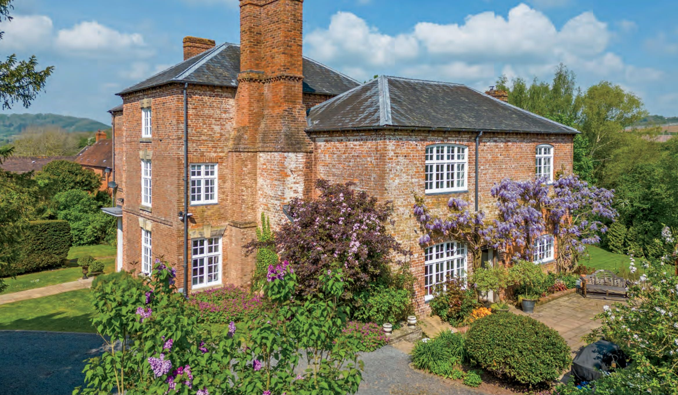
Lower House Farm Stockton | Worcester | Worcestershire | WR6 6UT