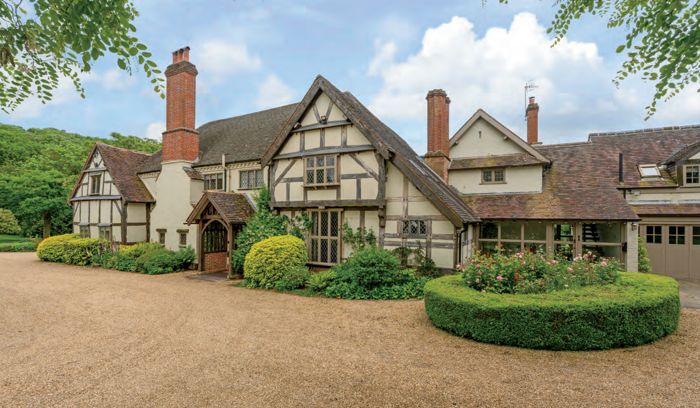
Becknor Manor Broughton Green | Droitwich | Worcestershire | WR9 7EE