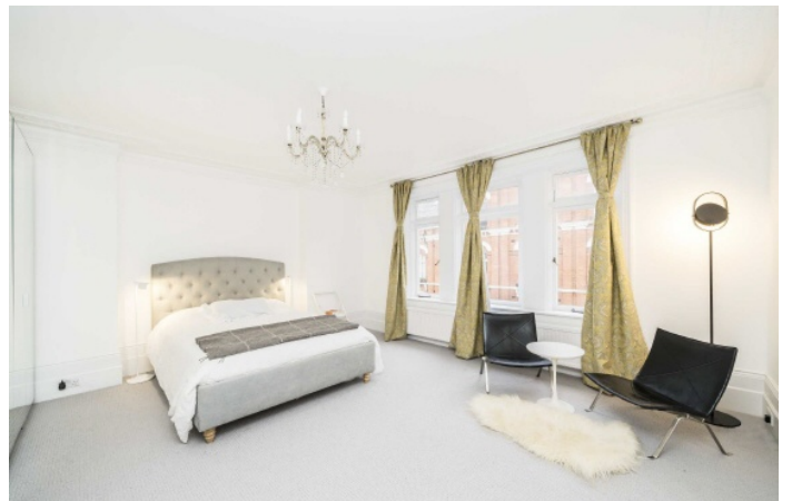
Carlisle Place, SW1P