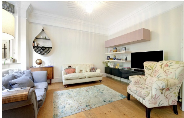
Greycoat Gardens, SW1P