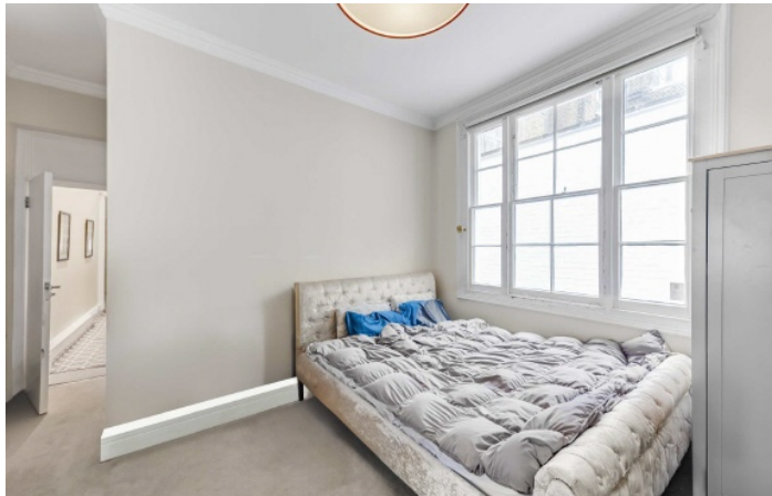
Warwick Square, SW1V