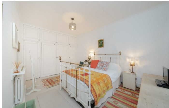
St. Georges Drive, SW1V