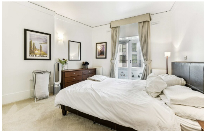
Victoria Street, SW1H