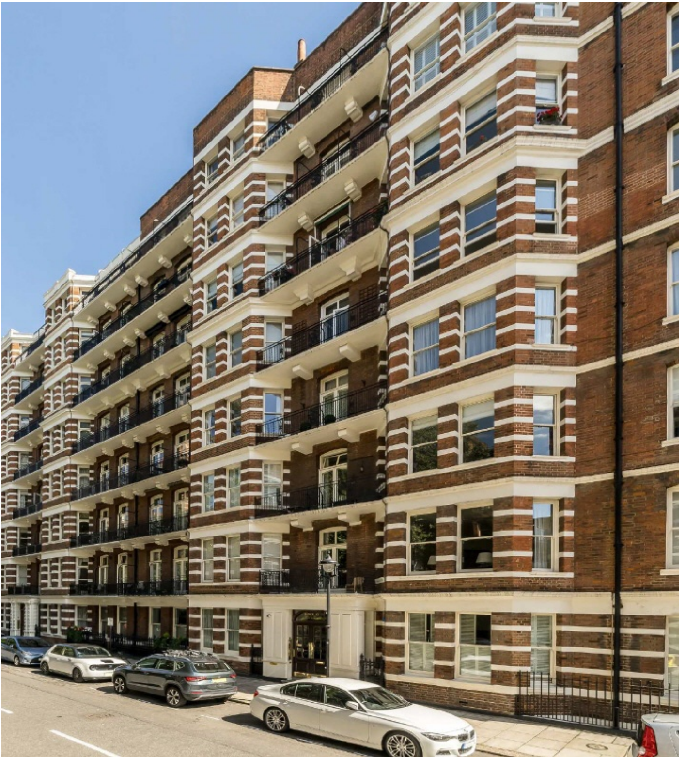
Ashley Gardens, SW1P £1,470,000