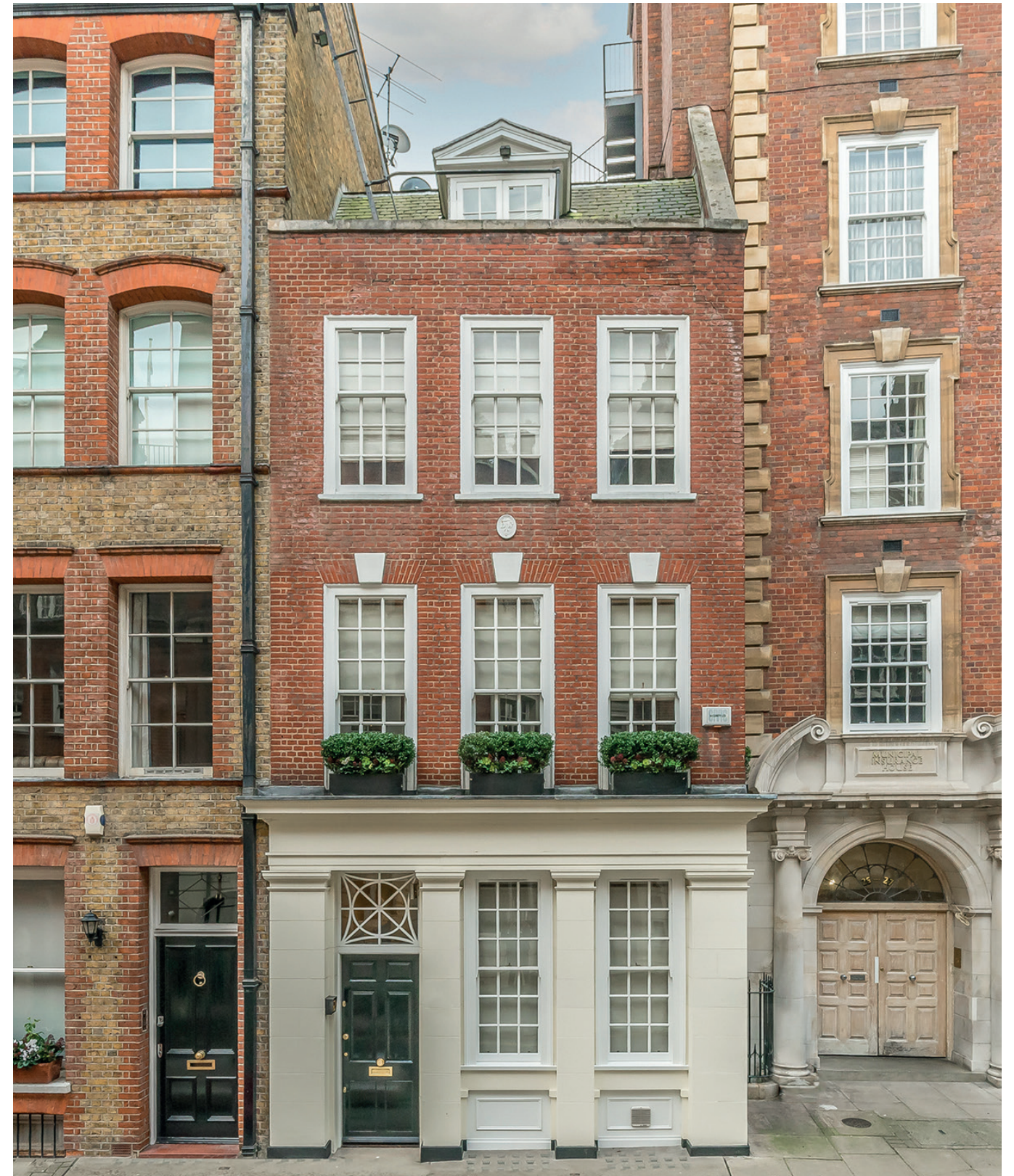
Old Queen Street Westminster