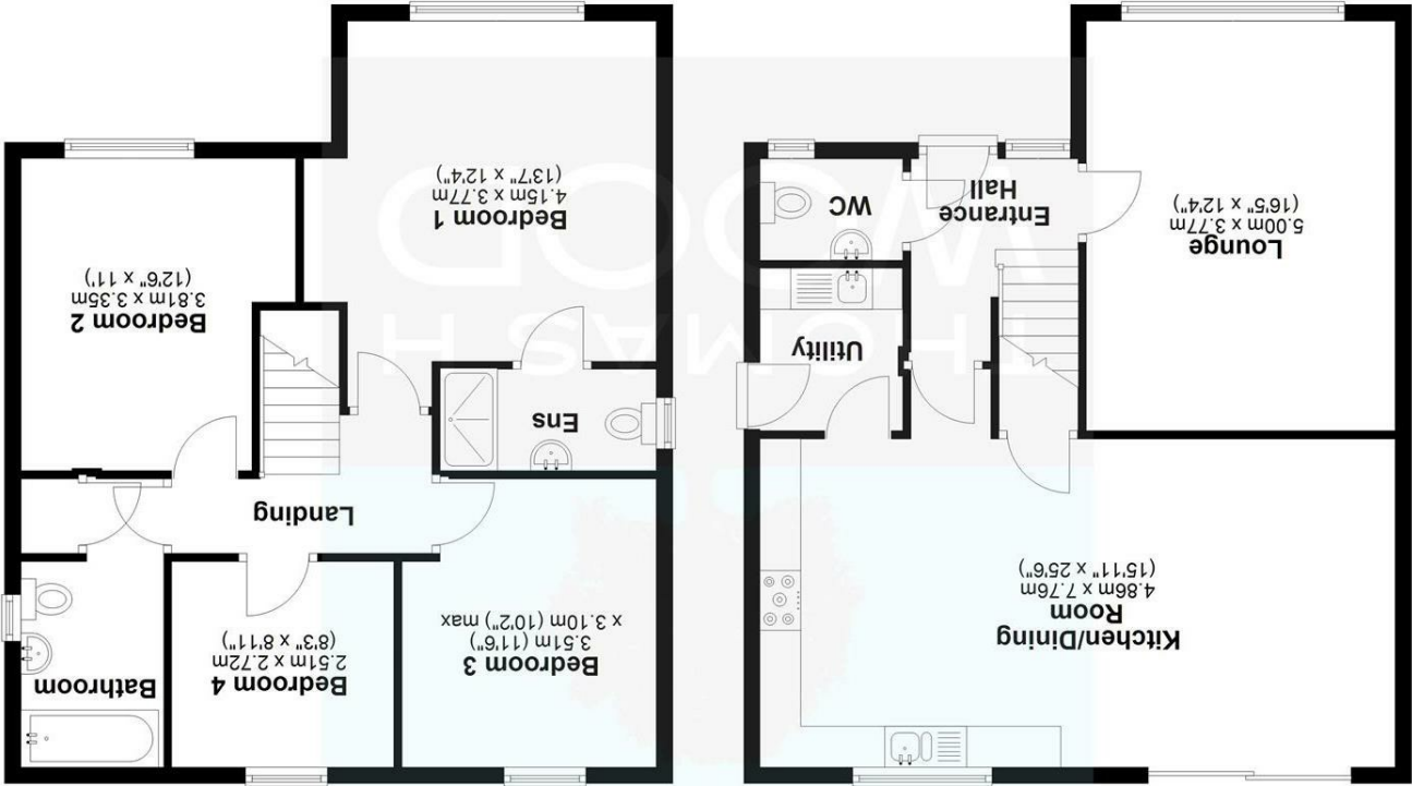
Ground Floor Approx. 64.0 sq. metres (688.8 sq. feet)