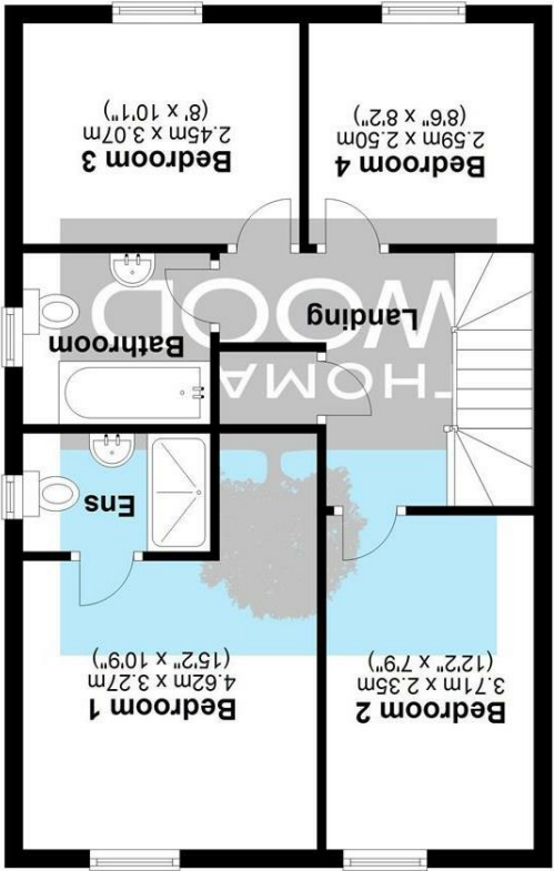
First Floor Approx. 52.6 sq. metres (565.8 sq. feet)