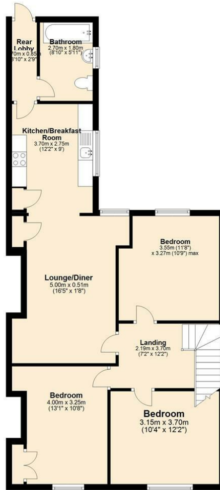
First Floor Approx. 80.2 sq. metres (863.4 sq. feet)