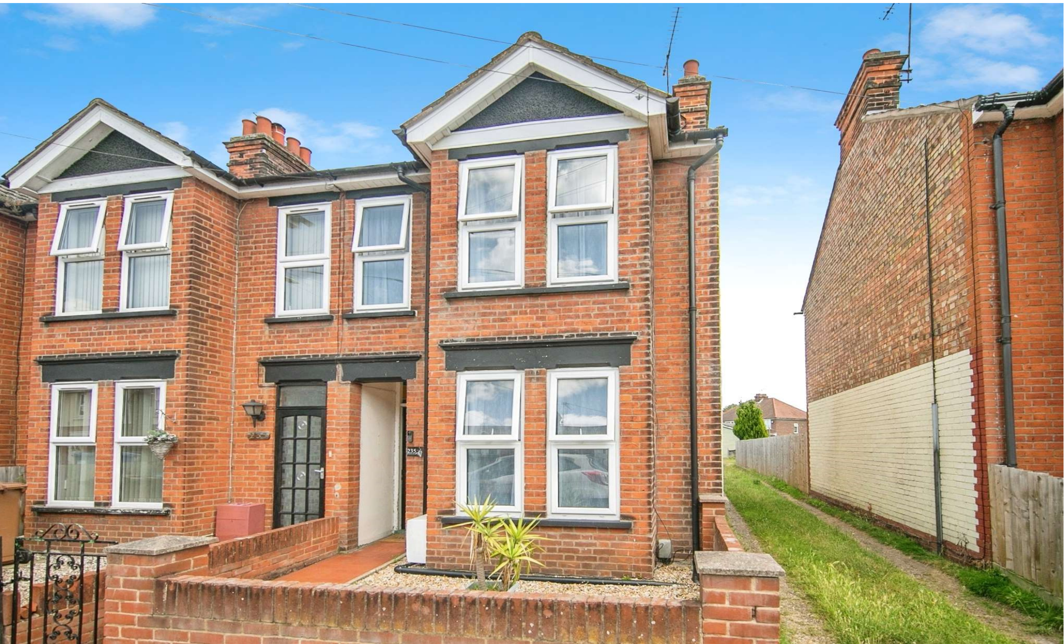
Britannia Road, Ipswich IP4 5HF

Not for marketing purposes INTERNAL USE ONLY