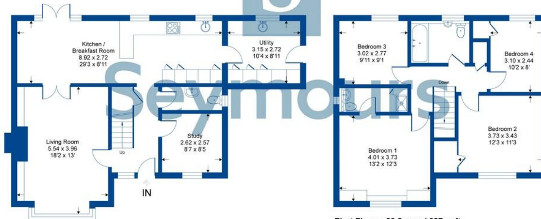
Ground Floor = 74.4 sqm / 801 sqft