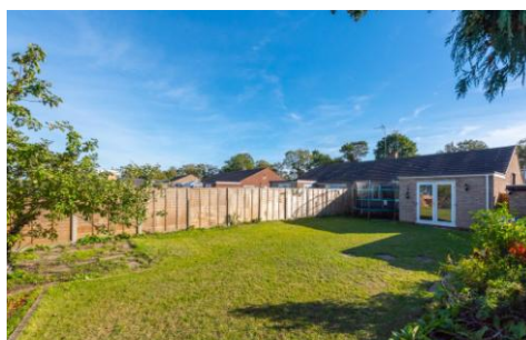
Beech Drive Camberley, GU17 oNA £450,000 Guide Price