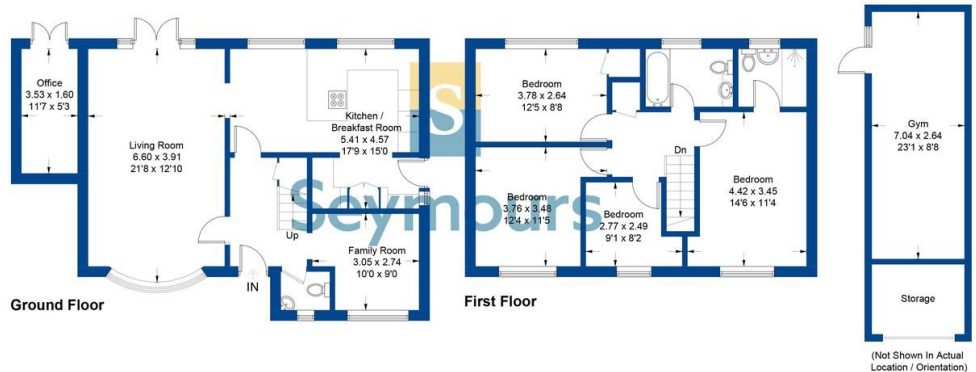
Illustration for identification purposes only, measurements are approximate, not to scale. FloorplansUsketch.com © 2024 (ID1050464)