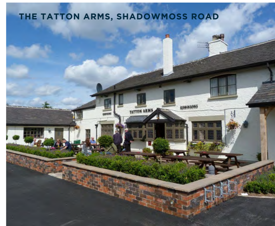
THE TATTON ARMS, SHADOWMOSS ROAD

From a 5 minute walk to a 5 minute drive the local community of Heald Green and Styal provides a wide range of destinations for food and beverages. Whether a light bite or sandwich for lunch or a more social gathering.