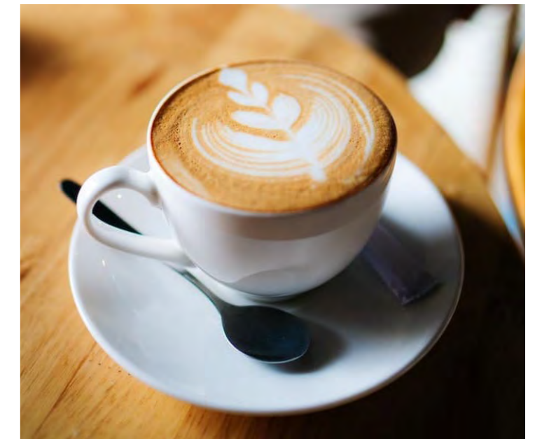
CAFÉ ON THE LANE, HEALD GREEN