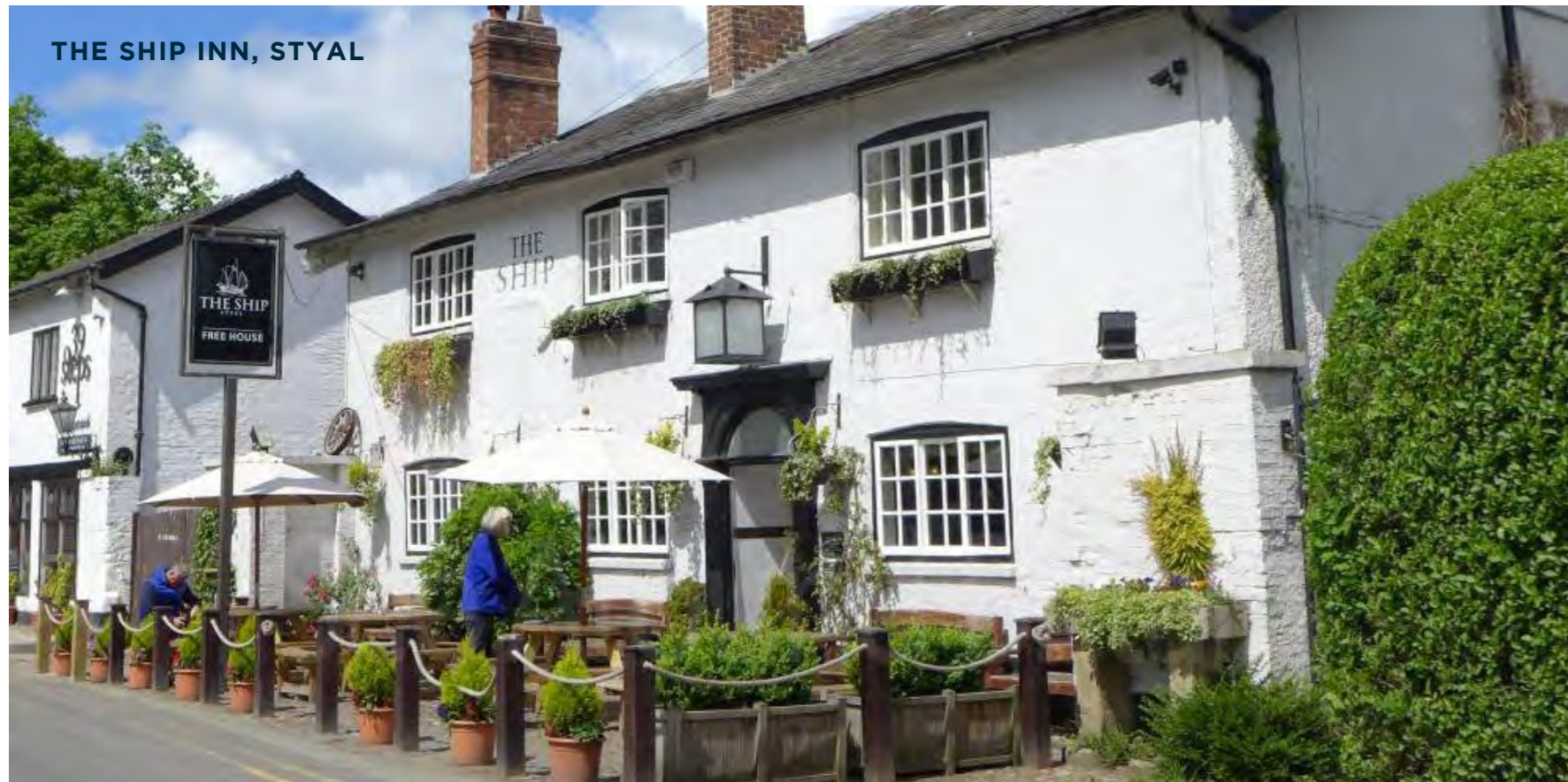
THE SHIP INN, STYAL