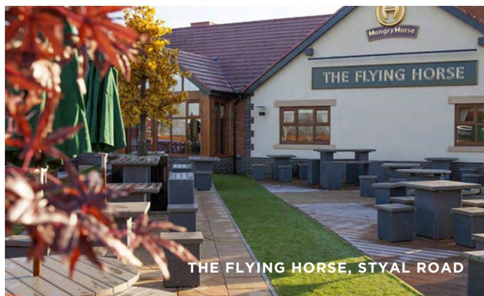
THE FLYING HORSE, STYAL ROAD

From a 5 minute walk to a 5 minute drive the local community of Heald Green and Styal provides a wide range of destinations for food and beverages. Whether a light bite or sandwich for lunch or a more social gathering.