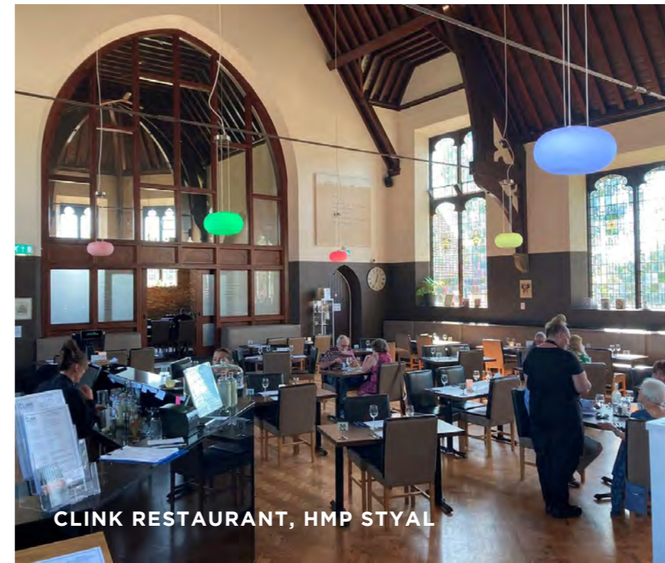
CLINK RESTAURANT, HMP STYAL