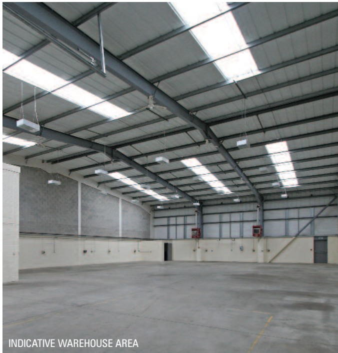
INDICATIVE WAREHOUSE AREA