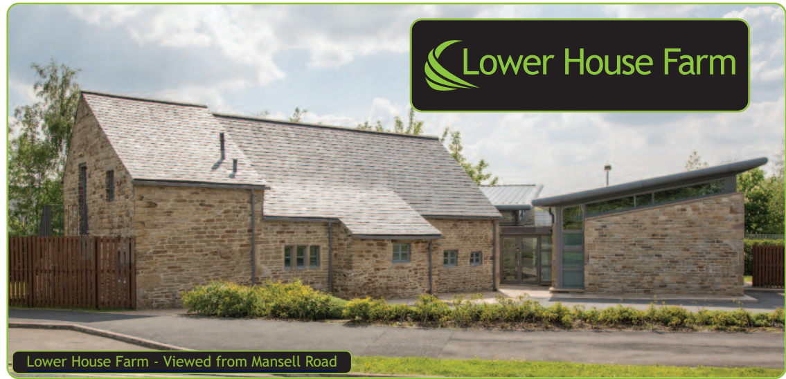
Lower House Farm - Viewed from Mansell Road