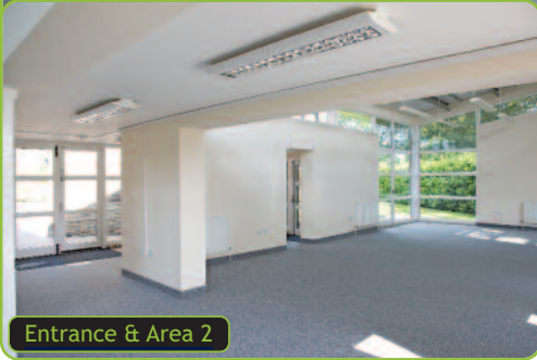
Entrance & Area 2