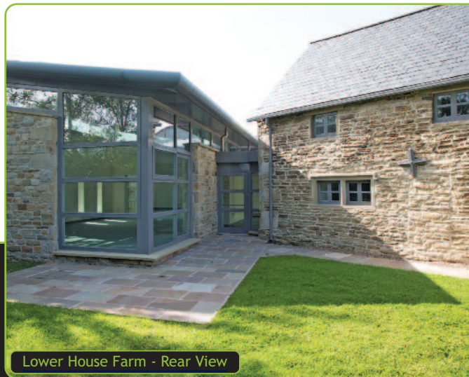
Lower House Farm - Rear View