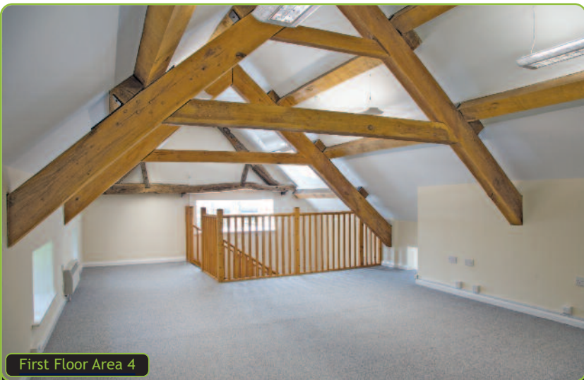
First Floor Area 4