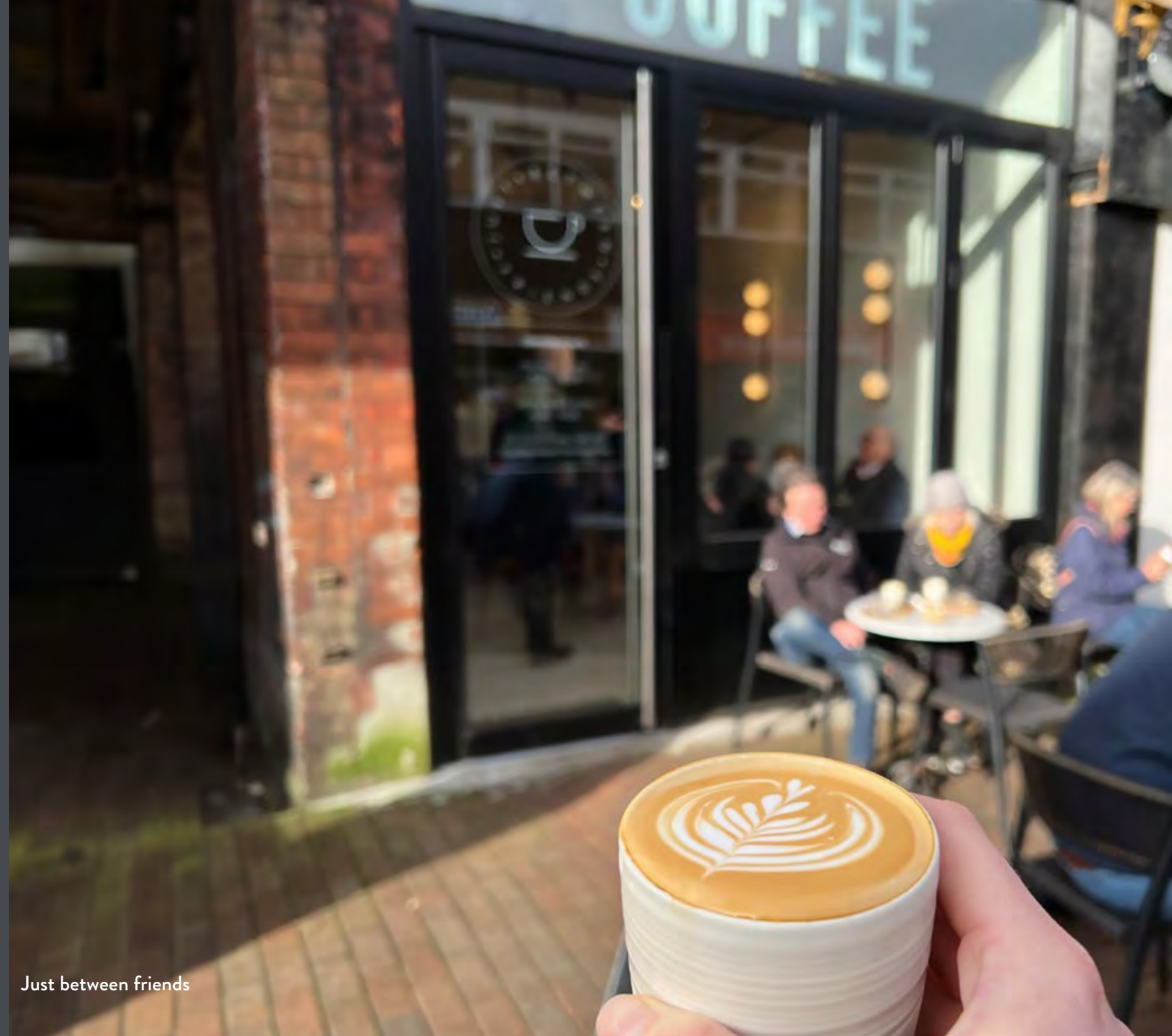
Just between friends