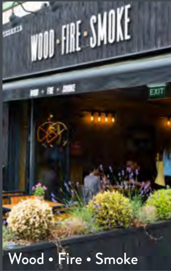
Wood • Fire • Smoke