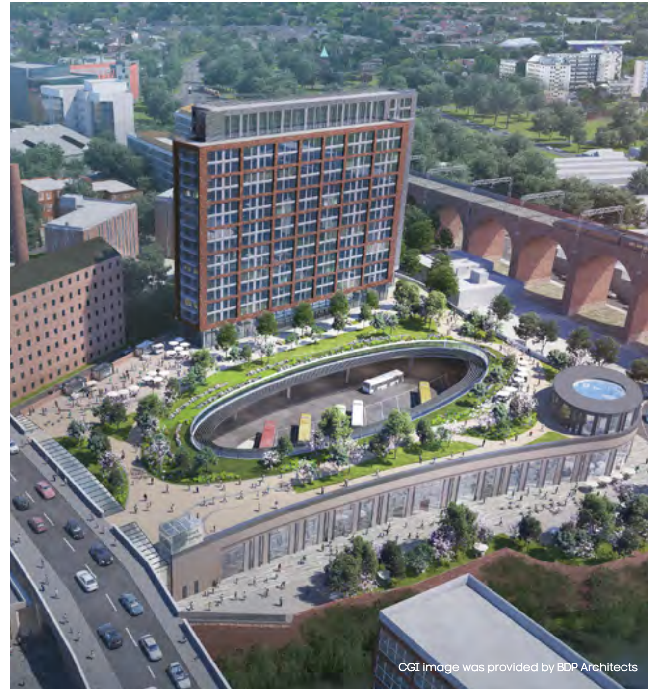
CGI image was provided by BDP Architects