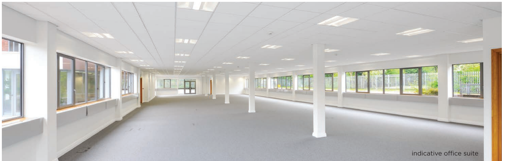
indicative office suite