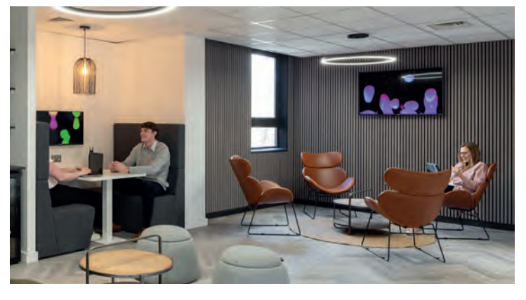
All images are indicative from similar Orbit properties, as this space is currently being fitted out as per the text.