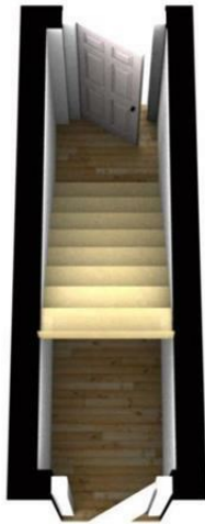
Ground Floor Approx. 3.1 sq. metres (33.0 sq. feet)