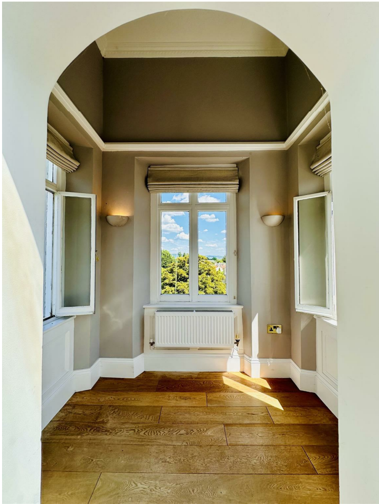
Views from Turret