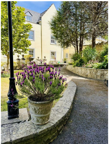
Communal Entrance and Lift