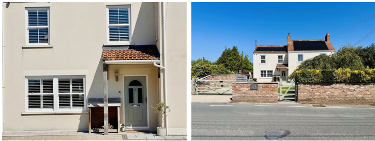
PLOT AND LOCATION