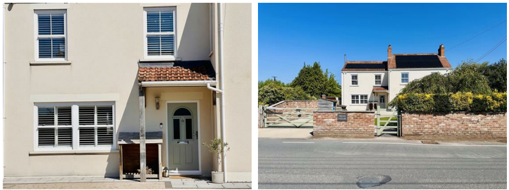
PLOT AND LOCATION