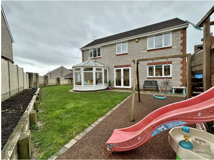
Plot and Location