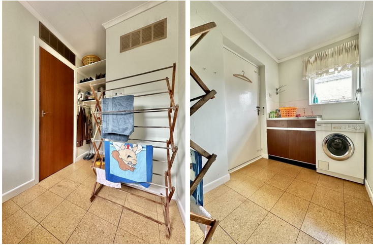
Back Door Porch Cloakroom