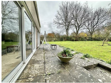
Side and Front Garden