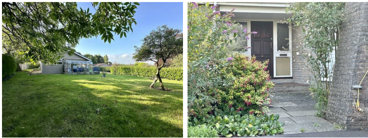
Plot and Location