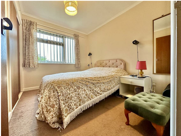
Bedroom Four Family Bathroom