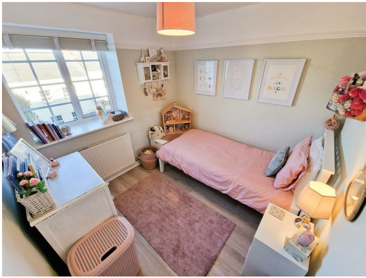
Bedroom 4 9'10 (max) x 7'7 (max) (3.00m (max) x 2.31m (max) ) A front aspect room with uPVC double glazed window, ceiling light, radiator.