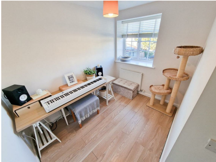
Bedroom 5 10'5 (max) x 8'4 (max) (3.18m (max) x 2.54m (max) ) A side aspect room with uPVC double glazed window, ceiling light, radiator, useful over stairs storage cupboard, lovely feature built in storage cupboards and shelves built in.