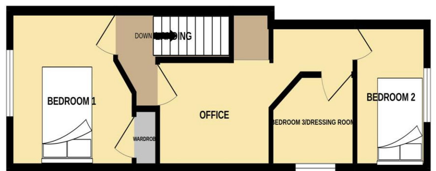
TOTAL FLOOR AREA : 639 sq.ft. (59.4 sq.m.) approx.

Whilst every attempt has been made to ensure the accuracy of the floorplan contained here, measurements of doors, windows, rooms and any other items are approximate and no responsibility is taken for any error, omission or mis-statement. This plan is for illustrative purposes only and should be used as such by any prospective purchaser. The services, systems and appliances shown have not been tested and no guarantee as to their operability or efficiency can be given. Made with Metropix ©2024