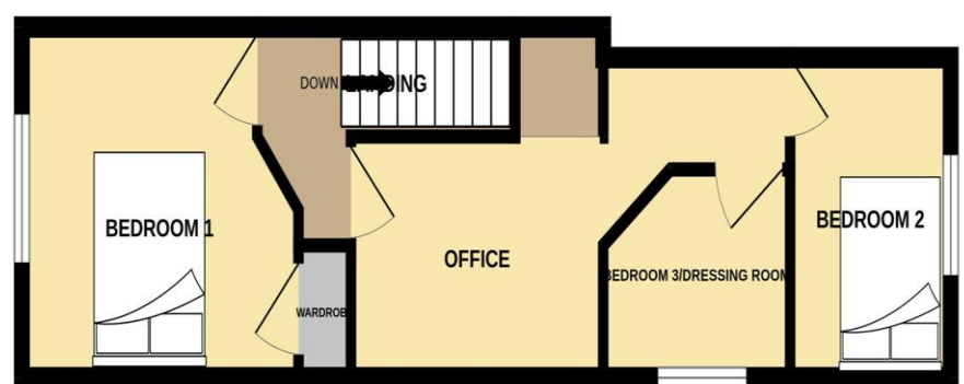
TOTAL FLOOR AREA : 639 sq.ft. (59.4 sq.m.) approx.

Whilst every attempt has been made to ensure the accuracy of the floorplan contained here, measurements of doors, windows, rooms and any other items are approximate and no responsibility is taken for any error, omission or mis-statement. This plan is for illustrative purposes only and should be used as such by any prospective purchaser. The services, systems and appliances shown have not been tested and no guarantee as to their operability or efficiency can be given. Made with Metropix ©2024