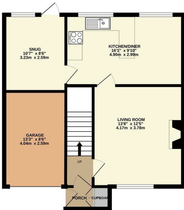
GROUND FLOOR 598 sq.ft. (55.5 sq.m.) approx.