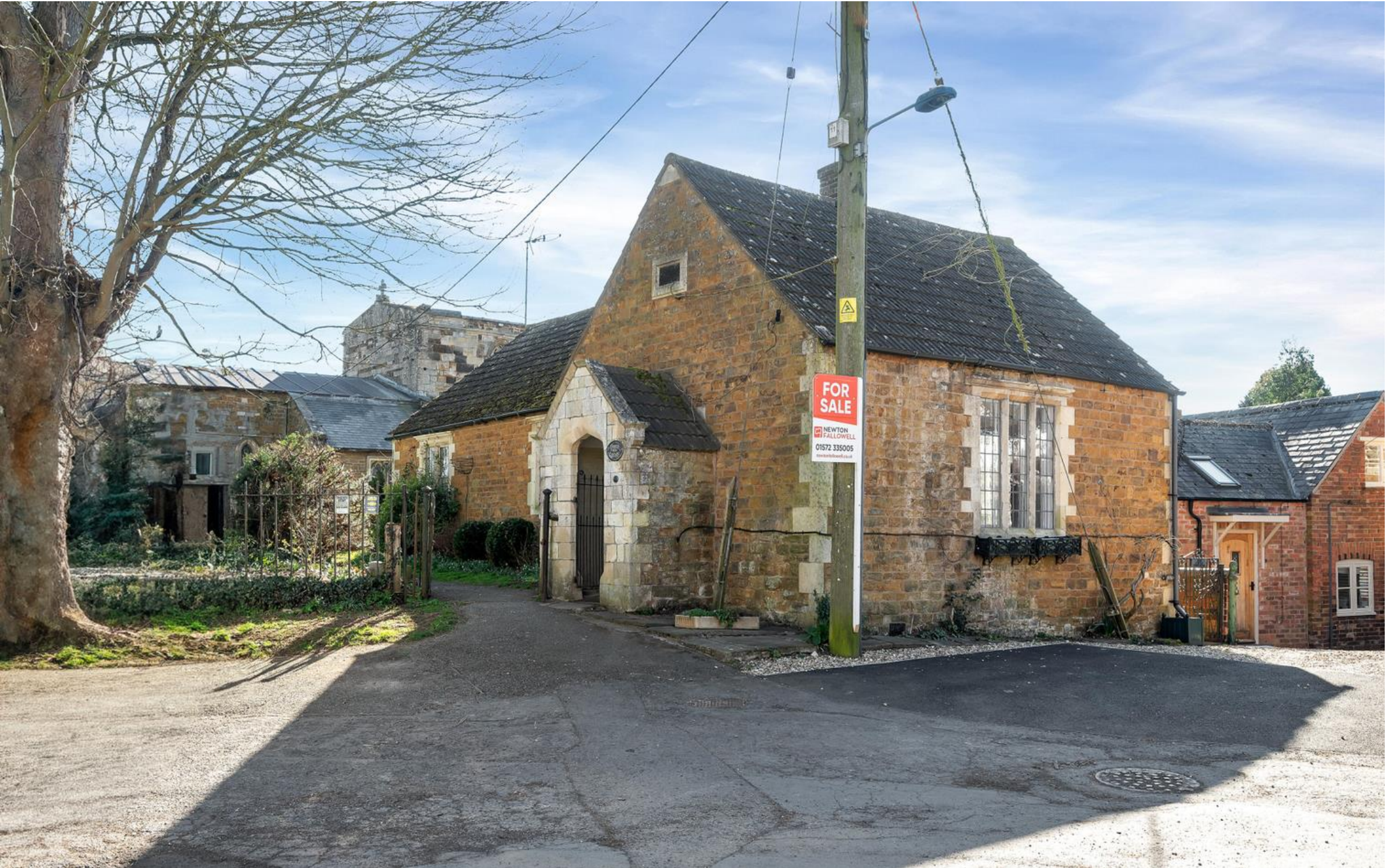
Church Cottage, 31 Cedar Street, Braunston, Oakham, LE15 8QS