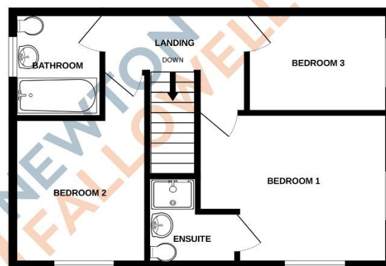
1ST FLOOR 436 sq.ft. (40.5 sq.m.) approx.